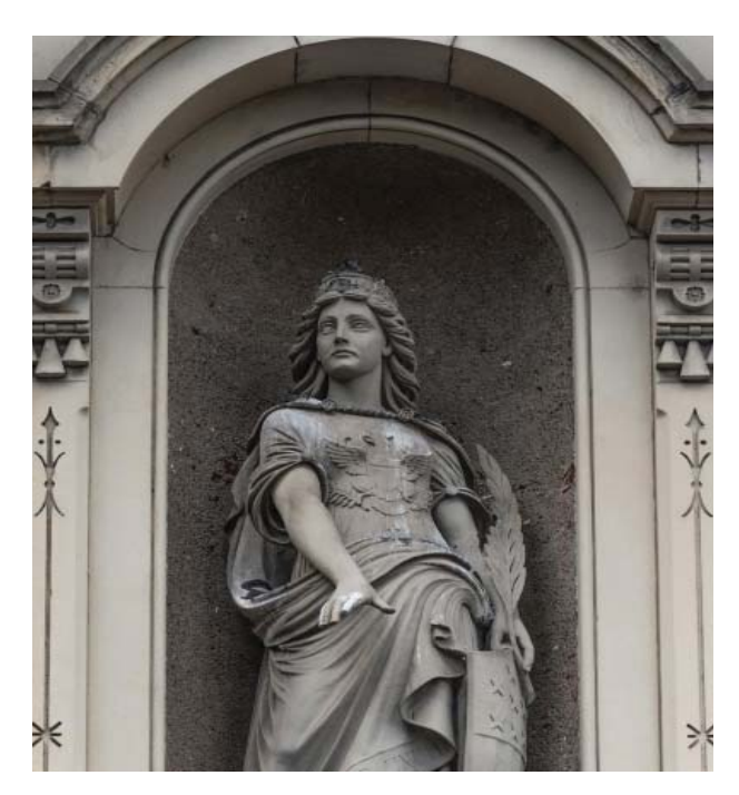
The Germania Statue (author's collection)

1923: By the time of his demise on 6 January, he had published numerous books and articles, and edited two German-American historical journals.