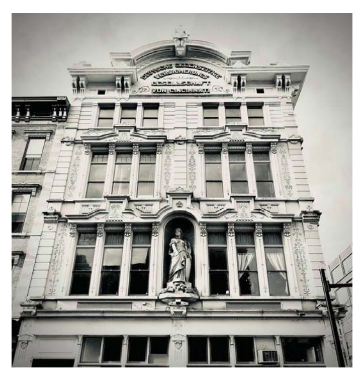
The Germania Building

1895: Organized the first German Day in Cincinnati at the Cincinnati Zoo. This led to the formation of the German Day Society, later re-named the German-American Citizens League, which has sponsored the event ever since.