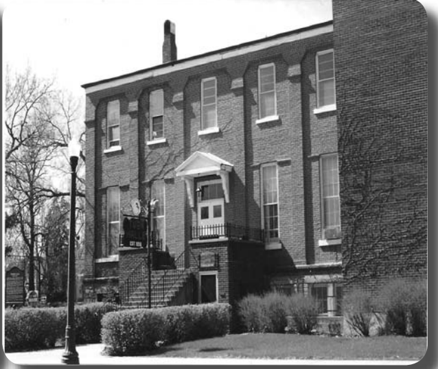
Turner Hall in Cincinnati.