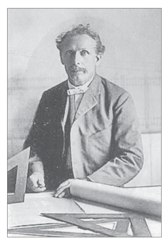
Wilhelm Hildenbrand Author's collection

During the 1937 flood, the bridge was the only highway bridge open on the entire 800-mile stretch of the Ohio River from Ohio to Illinois. In 1953, the bridge was acquired by the state of Kentucky, and the wooden floor replaced with metal grating that gives it a humming sound when driving across the bridge, causing it to be referred to as "the singing"