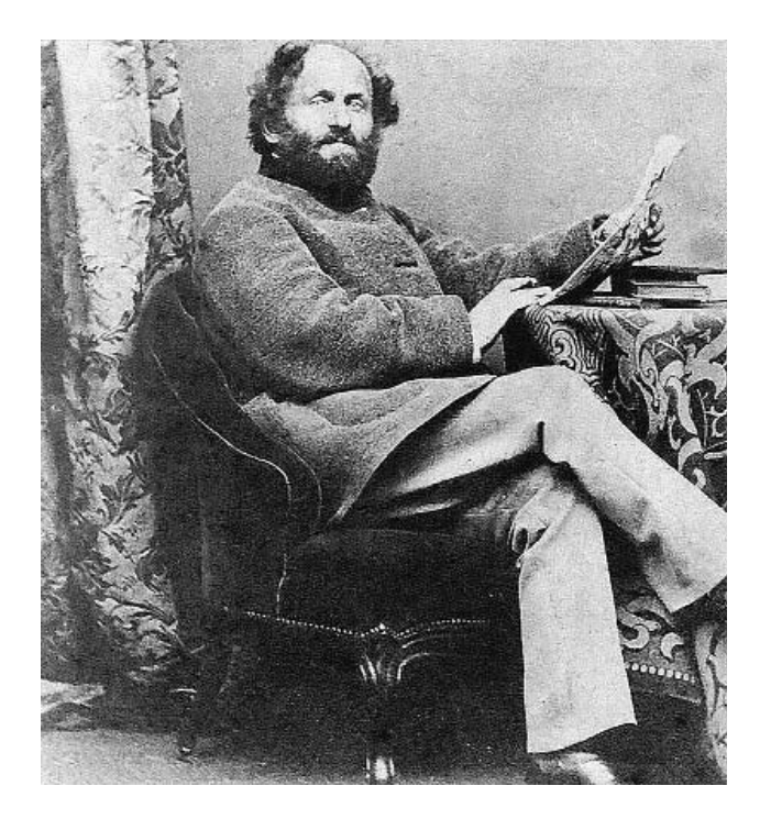
FRIEDRICH GERSTÄCKER CA. 1870